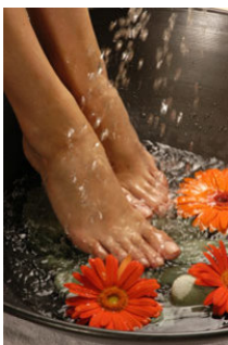
"clients should be told not to shave their legs within 24 hours prior to receiving a pedicure"